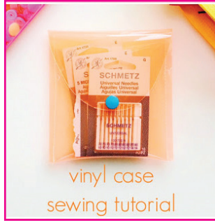
vinyl case sewing tutorial