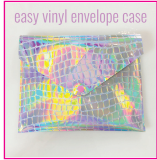
easy vinyl envelope case